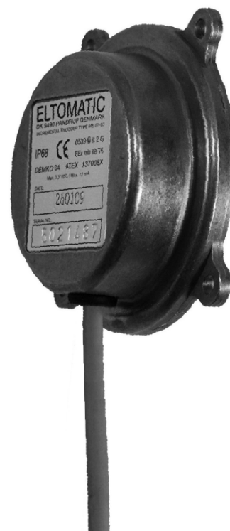
ME01-03 magnetic encoder