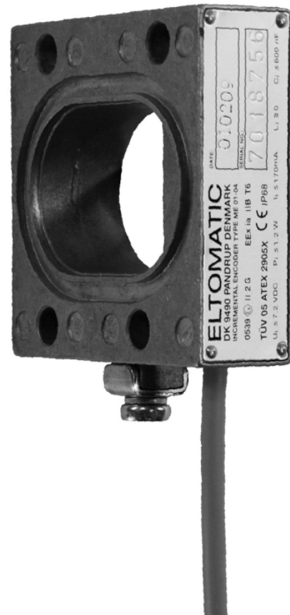
ME01-02 magnetic encoder

Eltomatic A/S • Fabriksvej 6 • DK9490 Pandrup • Denmark