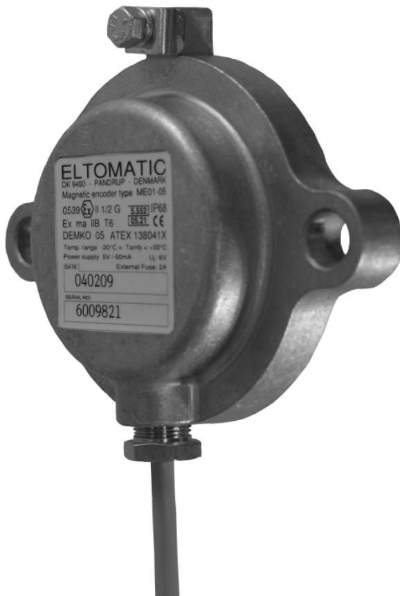
ME01-05 magnetic encoder